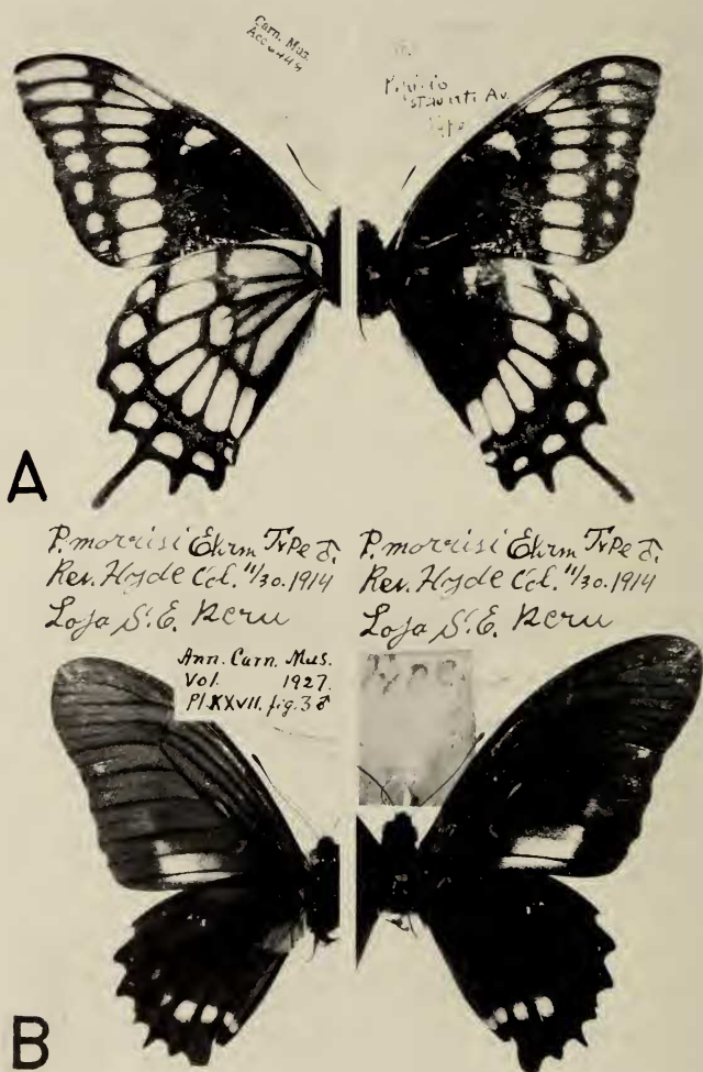
FIG. 1. Papilio holotype males. A, P. stewarti , upper surface on right, under on left; forewing expanse, base to apex, 50.0 mm; B, P. morrissi , as above; forewing expanse 40.0 mm.